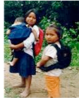
Tsimane children with a spider monkey

While indigenous communities live inside the Indigenous Territory and the Reserve, colonists have settled in some buffer zones and outside this territory. As boundaries of both the indigenous territory and the Biosphere Reserve have been officially demarcated, there are not yet violent conflicts between indigenous communities and colonists settlements. However, many indigenous people fear that if further migration persists, it will lead to the invasion of the indigenous territory.