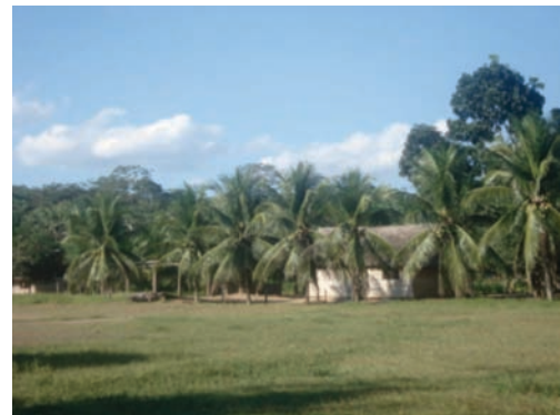
View of the indigenous community of Asuncion del Quiquibev

This is also correlated to the results obtained in the control activities undertaken by the Reserve’s park rangers. Although there are no official studies and data developed, the Director of the Biosphere Reserve considers that a correlation exists between the creation of the indigenous tourism enterprise and a reduction in deforestation and hunting.