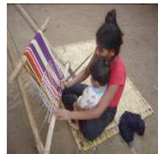
Indigenous women are part of the economic initiatives

The Area is clearly demarcated and has official boundaries. Everyone in the communities know the Area but not all the members of the