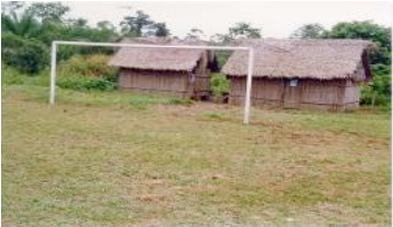
Unplanned settlements are feared by indigenous peoples

The positive conservation status is referred both to biodiversity and cultural status of indigenous communities living inside the Area. However, a topic discussed is related to the sustainability of the Area. It was acknowledged that the indigenous territory and the Biosphere Reserve in particular could face a process of change in the long term. This is related to potential problems in terms of colonisation and human settlements.