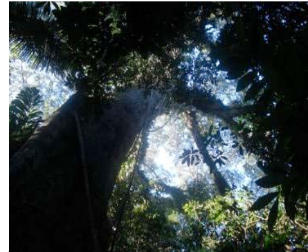
A Mapajo tree providing shadow in Pilon Laias

A representative of the local indigenous council adds: “Early in the reserve history, some private tourism agencies led groups into the Reserve without environmental and cultural considerations. In October 1997, the Tsimane and Mosesten Regional Council, received grants to undertake learning exchange trips to other Amazonian communities. The purpose of these learning exchanges was to understand how environmentally and cultural friendly initiatives and ventures could provide alternatives for income generation”.