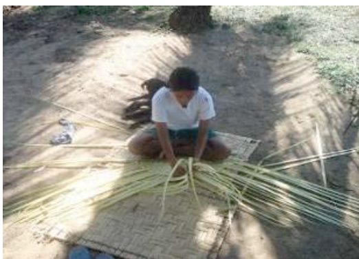
Gender participation was an important outcome in this process

3) Economic alternatives through income generation and land use planning: some economic alternatives and benefits were produced resulting in diminishing pressures on wildlife and timber resources. The community of Asuncion implemented a land use zoning plan which designated areas for tourism. In the plan, forest clearing and hunting are prohibited and less land clearing per family is taking place due to labour diversion.