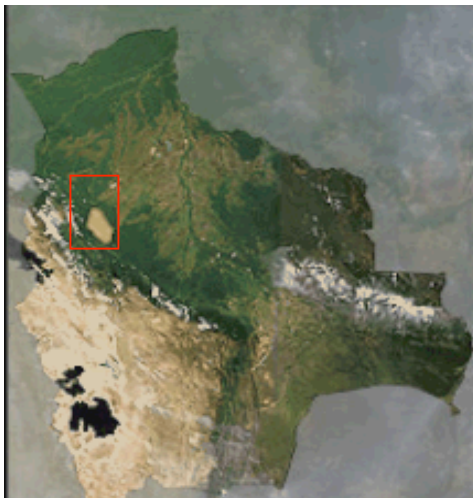
Map 1 & 2: Location of Pilon Lajas

These mountains are the last of the Andean foothills before the floodplains of the Beni department, with an average elevation of 300 meters above sea level. Of the reserve's great variety of ecosystems, the most remarkable for their richness in species and endemism are the Sub-Andean rain forests, pluvial piedmont forests, seasonally moist basal forests, and riparian forests and swamp (Ribera, 1999).