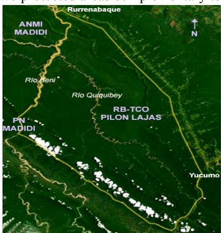
Map of Pilon Lajas

Pilon Lajas is flanked on its eastern side by the country's main road to the North, and the colonization zone. On its western side, the Beni River forms a natural border with the Madidi National Park-Integrated Natural Management Area (SERNAP, 2005). It has similar species than those located in the well-known Madidi National Park but in different habitat conditions and characteristics, making these two protected areas complementary to each other.