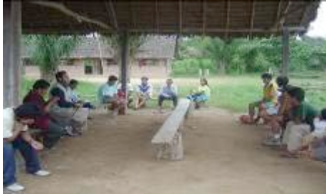
Communities are involved in decision-making through the Regional Council

In addition, training of community participants was also suggested for the management of the area, as