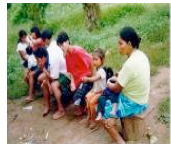
Alliances and networking are considered as significant

However, there is huge interest to develop alliances at an international level in particular, both for economic and political reasons. It was considered by the participants that the opportunity to get recognised beyond a local scale and the construction of a positive image of the Area based on the activities and outcomes achieved in the management of the indigenous territory and the biosphere reserve would be the best way to promote institutional alliances and a better process for fundraising for the medium and long term.